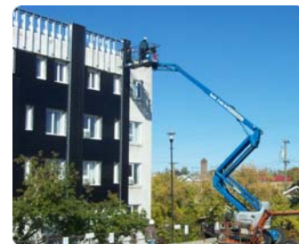
Energy Project - 2010