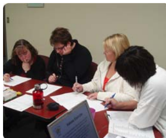
NRHA Strategic Planning Session at Primary Health Care