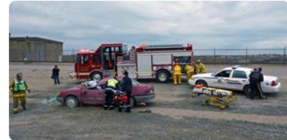
P.A.R.T.Y Program - Flin Flon