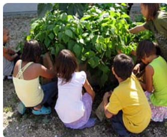
Container Gardening Project - The Pas