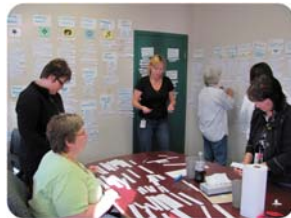
Sticky Wall Session - CHA Research Team