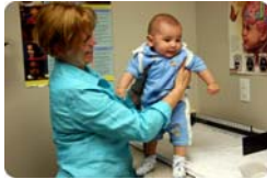
The Pas Healthy Baby Clinic